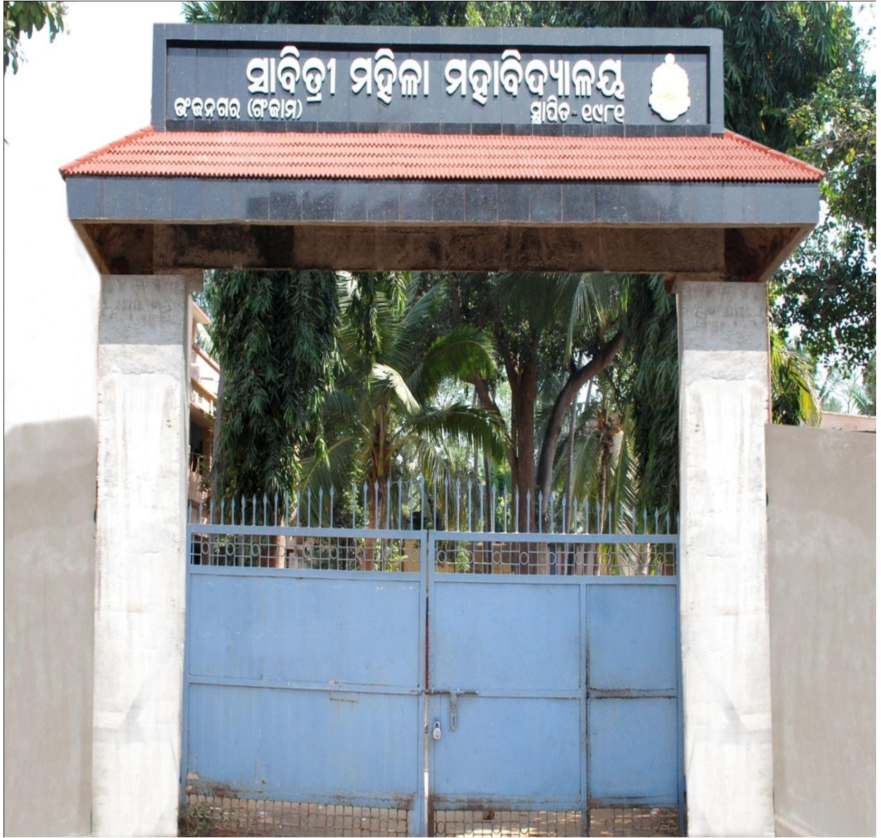
Entrance Gate of Savitri Women's College